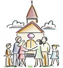
Invite a Neighbor to Church